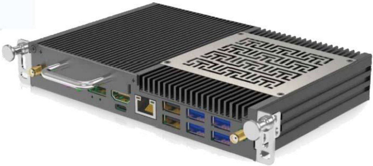
OPS-i5-12 & OPS-i7-12 180x 119x 30MM