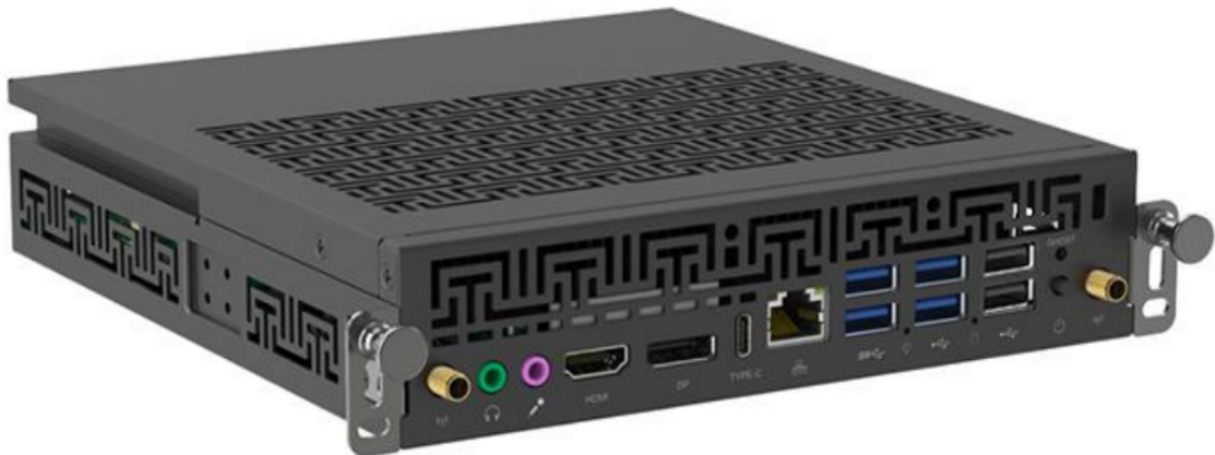
OPS-i5-19 & OPS-i7-19 180x 195x 30MM